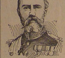
KING OSCAR OF SWEDEN.

The art exhibit will be international in character, and this feature will be of special interest, as the leading painters and sculptors of the world will be magnificently represented.