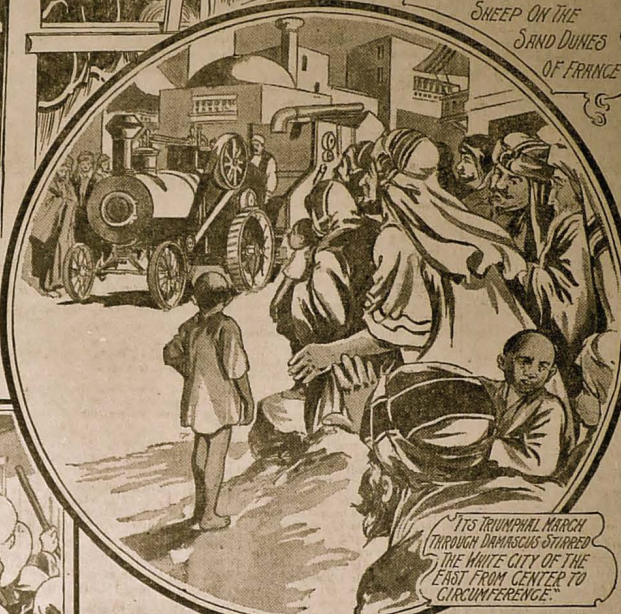
ITS TRIUMPHAL MARCH THROUGH DAMASCUS OVERTHREW THE WHITE CITY OF THE EAST FROM CENTER TO CIRCUMFERENCE.