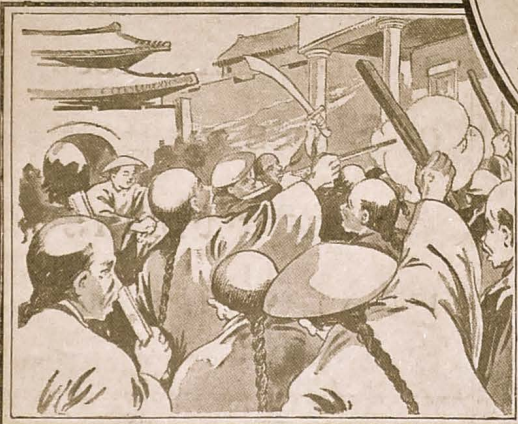
BOXERS ATTACKING AMERICAN LEGATION IN PEKIN, CHINA