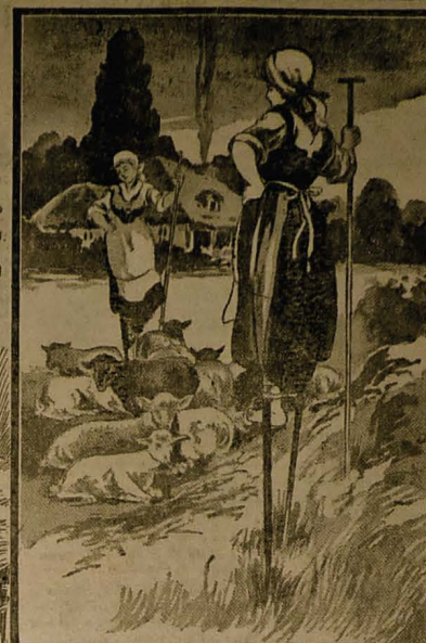
SHEPHERDS WATCHING THEIR SHEEP ON THE SAND DUNES OF FRANCE