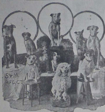
BURTON'S CELEBRATED DOG CIRCUS.

Twenty-sixth Annual Fair of The Pine County Agri- cultural Association.