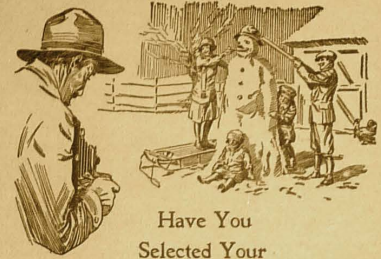
Have You Selected Your

The exhibitor and prize winners will be given next week.