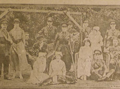
In pleasant contrast to the battle-ravaged plains of France is this peaceful and beautiful ground in Kensington, England, where the American Red Cross hospital No. 24. This picture shows British officers recuperating from their wounds, an American army captain and United States nurses.