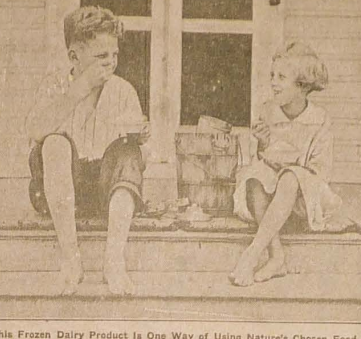
This Frozen Dairy Product is One Way of Using Nature's Chosen Food.

(Special Information Section, United States Department of Agriculture.)