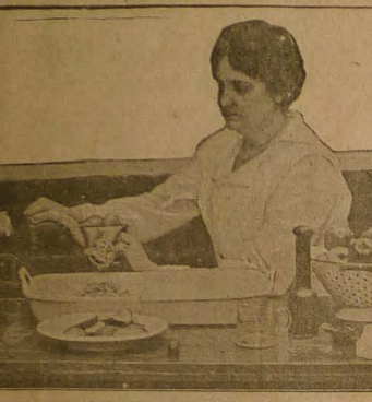
Apples for Vinegar May Be Run Through a Food Chopper.

(Special Information Section, United States Department of Agriculture.) MAKE CIDER VINEGAR AT HOME.