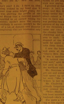
Cutting Him Along to the Nearest Elevator.

"I don't see it," said the boss, "I don't see it."