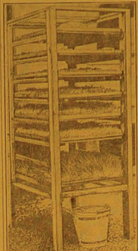
Sprouted Oats Help Materially in Furnishing Fowls With Needed Green Feed.

FEEDS FOR GROWING CHICKS In addition to furnishing Right Amount of Feed, Fresh Water and Shade Are Necessary. (Prepared by the United States Department of Agriculture.)