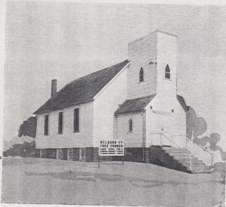
MILBURN EVANGELICAL FREE CHURCH Route 1, Pine City, Minnesota