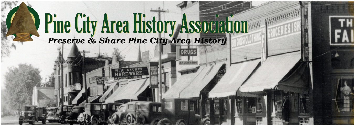
Pine City about 1936