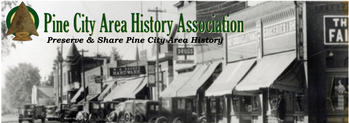
Pine City about 1936 - photo courtesy of Michael Sausser