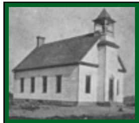
Pine Grove School 1909