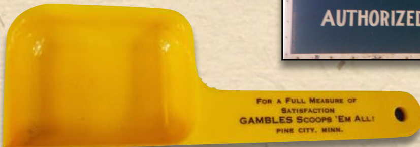
A coffee scoop, given as a gift to customers.