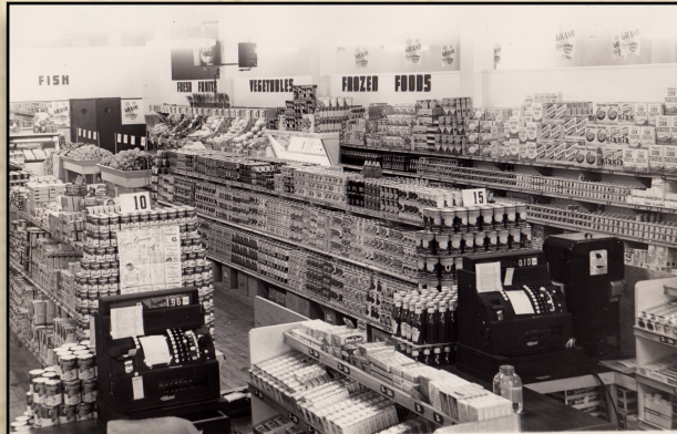
The interior of Mel Kutzke's Gamble Store