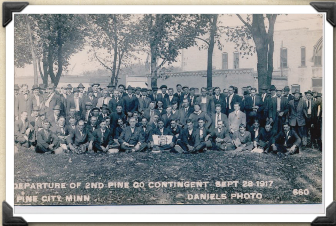
DEPARTURE OF 2ND PINE CO CONTINGENT SEPT 22 1917 PINE CITY MINN 660

After the exercises in the park, the crowd repaired to the court house corner, where music was had. The Liberty Boys were in the court house yard where they were served home made candy by the ladies employed there and cigars and patriotic post cards were distributed by Auditor Hamlin. Each of the boys was also presented with a Comfort Kit.