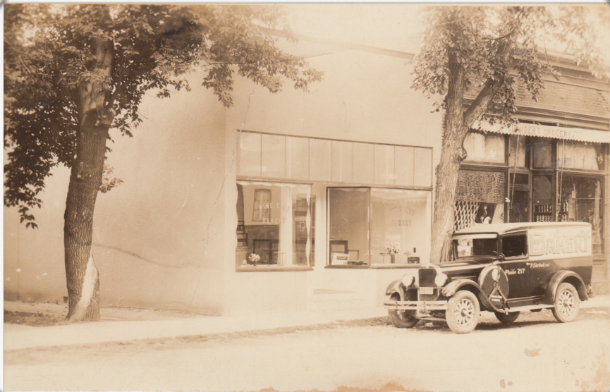
Pine Poker March 11, 1927