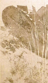
THE WHIPPET TANK WHICH APPEARED AT RUSH CITY MONDAY AND AT HINCKLEY WEDNESDAY, TO ADVERTISE THE VICTORY LOAN