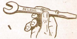
THE ONLY TOOL REQUIRED WITH A NEW DE LAVAL

Such simple construction makes the De Laval not only the longest lasting but also the easiest separator to clean and care for.