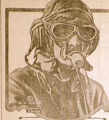
This is the transmitter of the wireless telephone that has been put in successful operation between the land and plane a great distance away. It is worn by the man in the plane.