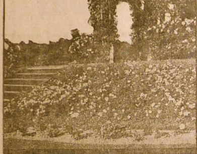
A Bank Covered by Wickiaria (Memorial Rose), With Rugosa Roses Against the Summer House in the Background.

Gardens for fruits, vegetables and flowers should always be provided, and if they are located near the house they will not only be convenient, but they will add greatly to the appearance of the whole place.