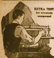
EXTRA TEST for accurate compound