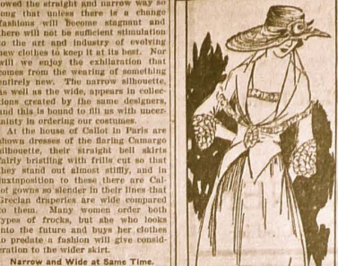
Taffeta is a favorite material for these gowns, because the stiffness of the silk aids greatly in accomplishing the desired silhouette.