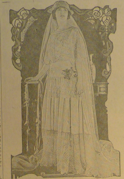
An Exquisite Wedding Gown

THE brides of this June, like those of other June, are privileged to make a comprehensive review of styles that are up-to-the-minute and of their wedding gowns. At least ninety per cent of them will choose the alluring modes of today, for the past has nothing lovelier to offer. They will be married in gowns sufficiently dignified for the occasion but modish enough to be used afterward for evening wear.