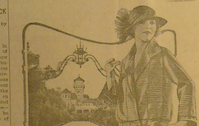
The Jaquette Suit

THE brides of this June, like those of other June, are privileged to make a comprehensive review of styles that are up-to-the-minute and of their wedding gowns. At least ninety per cent of them will choose the alluring modes of today, for the past has nothing lovelier to offer. They will be married in gowns sufficiently dignified for the occasion but modish enough to be used afterward for evening wear.