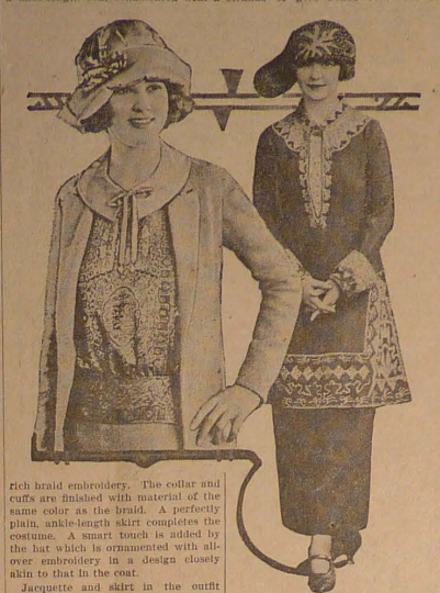
Both Follow Persian Style

FASHION is again dallying with the art of the Orient without confining itself to any particular country or period. The influence of China is seen in costumes and millinery. There are new developments in costumes that show their inspiration to Indo-China, India and Tibet but not least, to Persia, and this Persian influence promises to add a great deal of novelty and color to the season's styles. The suit shown in the right here shows its line from the costume of the Persian court. It is of serge made with a knee-length coat ornamented with a