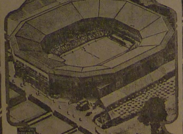
The aerial view shows the center court at the famous Wimbledon tennis stadium in England in which William M. Johnston and Francis T. Hunter, two American players, battled for the world's championship.