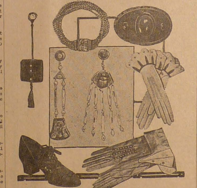
Some Nifty Accessories

If coffee disagrees drink Postum... There's a Reason