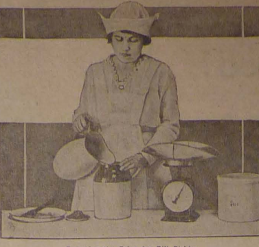
Preparing the Brine for Dill Pickles.

(Prepared by the United States Department of Agriculture.) Dill pickles are made from fresh or salted cucumbers (the former are chosen) by the United States Department of Agriculture, but the latter have better keeping qualities. Empty pickled dill seed or herb and "dill spice" composed of allspice, black pepper, coriander seed and bay leaves, in addition to the brine.