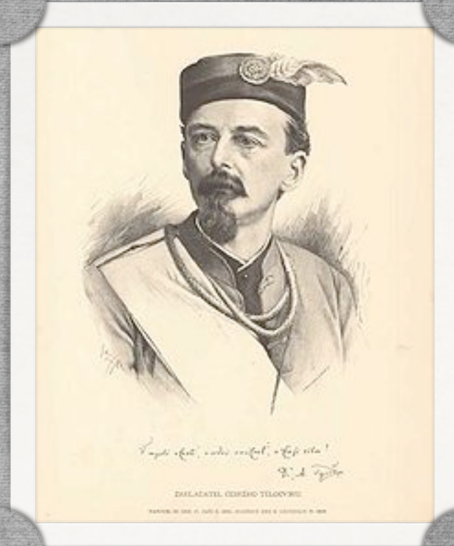
Miroslav Tyrš founder of the Sokol movement

The word Sokol comes from the Slavic word for falcon. The Sokol movement is an all-age gymnastics organization first founded in Prague in the Czech region of Austria-Hungary in 1862 by Miroslav Tyrš and Jindřich Fügner. It was based upon the principle of "a strong mind in a sound body." The Sokol, through lectures, discussions, and group outings provided what Tyrš viewed as physical, moral, and intellectual training for the nation. This training extended to men of all ages and classes, and eventually to women. The Sokol movement spread to the United States. The first American Sokol unit was founded on February 14, 1865, in St. Louis, Missouri. Today the American Sokol offer physical training in gymnastics and other athletics, as well as providing cultural awareness and family oriented activities. There are currently 35 American Sokol units, or clubs, operating in North America.