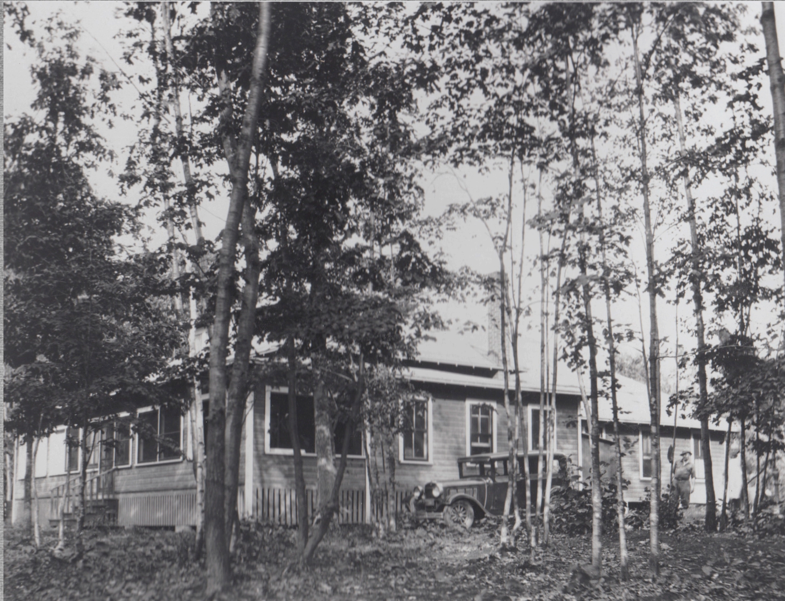
Shortly after the Sokol organization was formed in Pine City a camp was built on the east side of Cross Lake and an annual celebration was established.