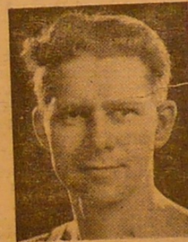
Chief Physical Instructor of Northern District American Sokol Union