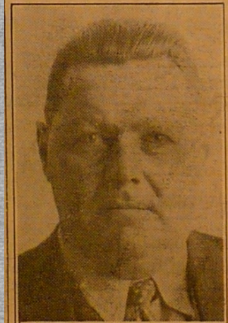
President Pine City Sokol Society